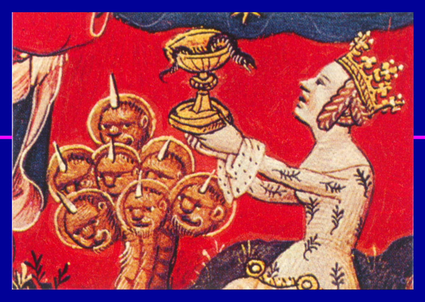
West Flemish Apocalypse